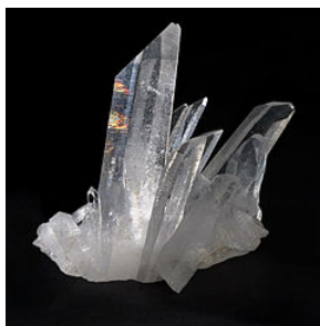
Figure 12.2.1: A crystalline arrangement of quartz crystal cluster. Some large crystals look the way they do because of the regular arrangement of atoms (ions) in their crystal structure.

In the solid state, the individual particles of a substance are in fixed positions with respect to each other because there is not enough thermal energy to overcome the intermolecular interactions between the particles. As a result, solids have a definite shape and volume. Most solids are hard, but some (like waxes) are relatively soft. Many solids composed of ions can also be quite brittle.