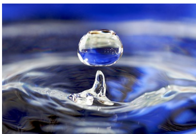
Figure 12.2.2: The formation of a spherical droplet of liquid water minimizes the surface area, which is the natural result of surface tension in liquids.

If the particles of a substance have enough energy to partially overcome intermolecular interactions, then the particles can move about each other while remaining in contact. This describes the liquid state. In a liquid, the particles are still in close contact, so liquids have a definite volume. However, because the particles can move about each other rather freely, a liquid has no definite shape and takes a shape dictated by its container.